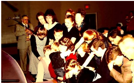
Our 1998 TDF Commissioning Service: A formal goodbye process

Missionaries say hundreds if not thousands of goodbyes, but practice does not perfect the process. In fact, adult MKs (missionary kids) list "goodbye grief" as a difficulty with which they later struggle as adults. Regularly saying goodbyes takes a toll. In addition, a child may make a good friend in the culture new to them and then move again shortly after that! The constant nomadic lifestyle lived apart from extended family and long, continuous childhood friendships encourages two known responses. Some MKs make friends quickly and engage in frenetic activity but do not allow a relationship to dive deep. Other MKs prefer to seclude themselves, thinking, "Why bother making friends? We leave in a few months." Both reactions develop problems and can ring true of missionary parents, too! If