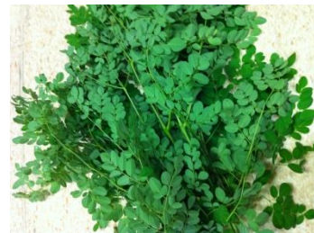
Moringa Oleifera leaves